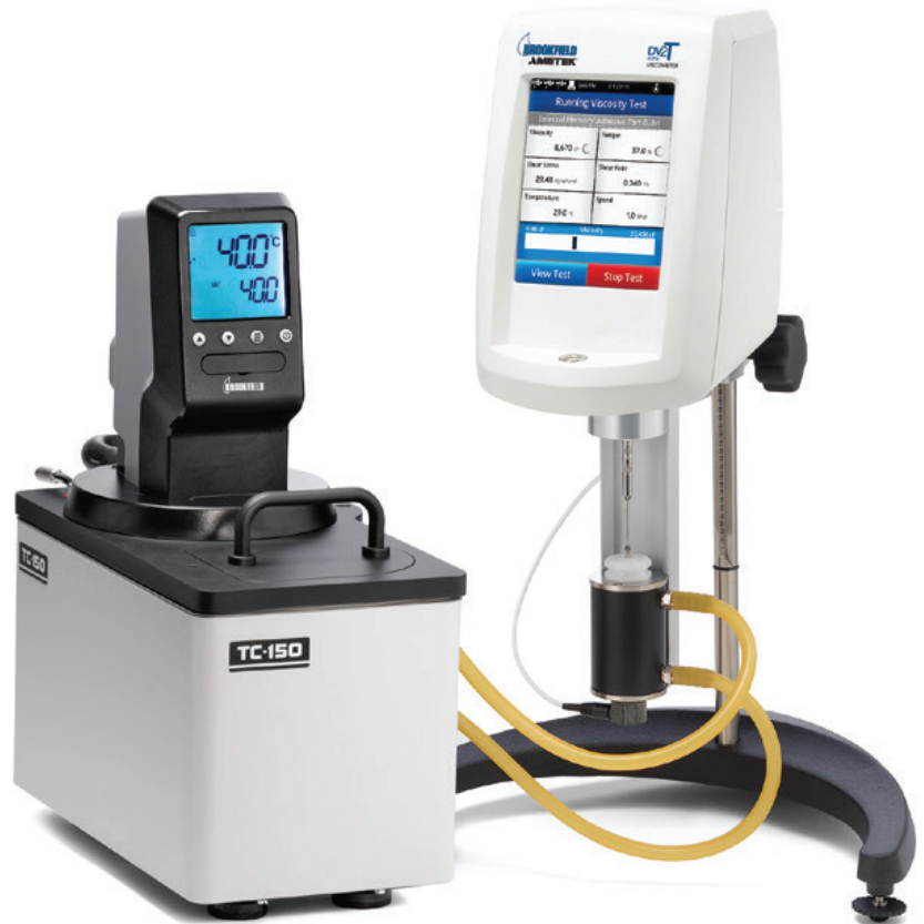
Complete system shows the DV2T Viscometer and Small Sample Adapter with Circulating Water Bath for temperature control.

The Small Sample Adapter provides a defined geometry system for accurate viscosity measurements at precise shear rates. Consisting of a cylindrical sample chamber and spindle, the Small Sample Adapter is designed to measure small sample volumes of 2 to 16 mL, and easily attaches to all standard AMETEK Brookfield Viscometers/Rheometers.