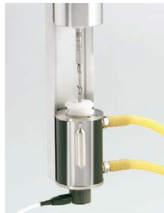
Standard Sample Chamber with embedded temperature probe provides direct temperature measurement of sample