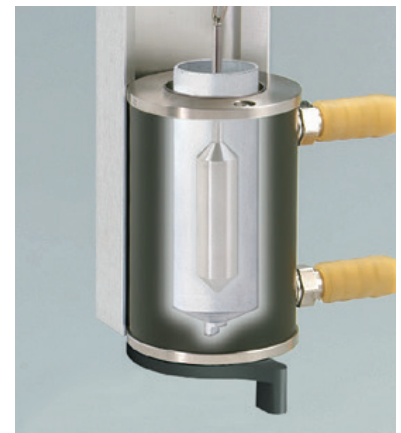
Disposable Sample Chamber (Requires SSA-DCU Water Jacket)