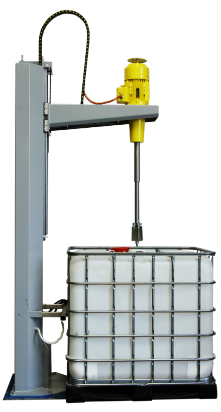
Option: direct mixing in IBC container