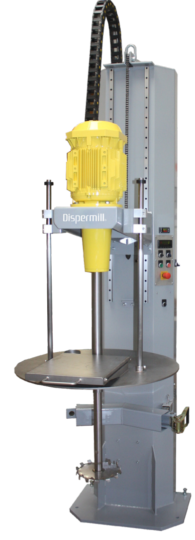
Option: integrated lid to cover the vessel